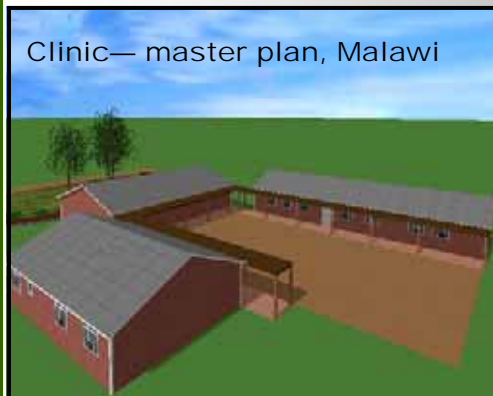
Clinic— master plan, Malawi

now behind them and their water well projects have paved a way of favor with the authorities. This year our support continued as we were able to give $10,000 to help in a $100K matching fund campaign that a generous partner had set up for the funding of wells in the needy regions of Malawi ( BTW—the $100K was reached—and matched!! ).